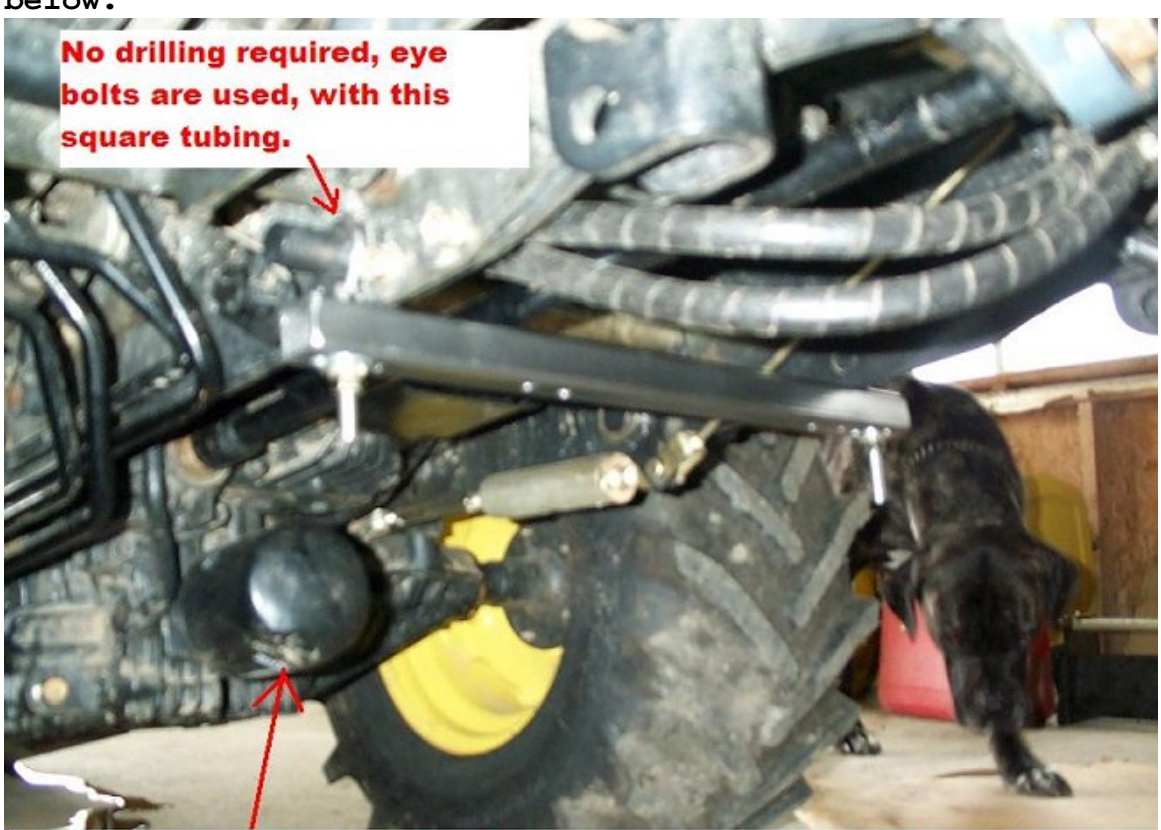
This is the one of reason for the skid plate, the other is the Fan.