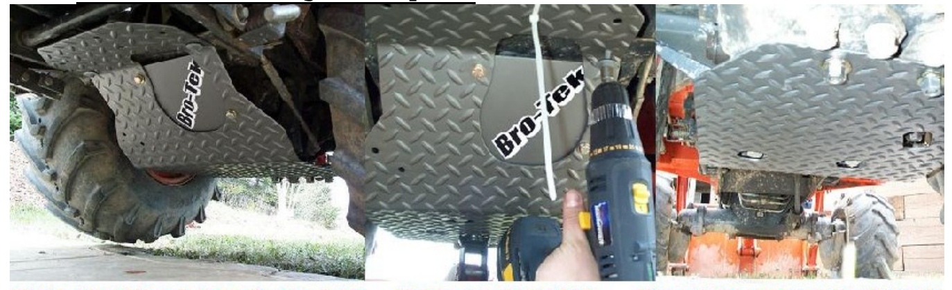
Under the BX, very good coverage. Very easy to install.