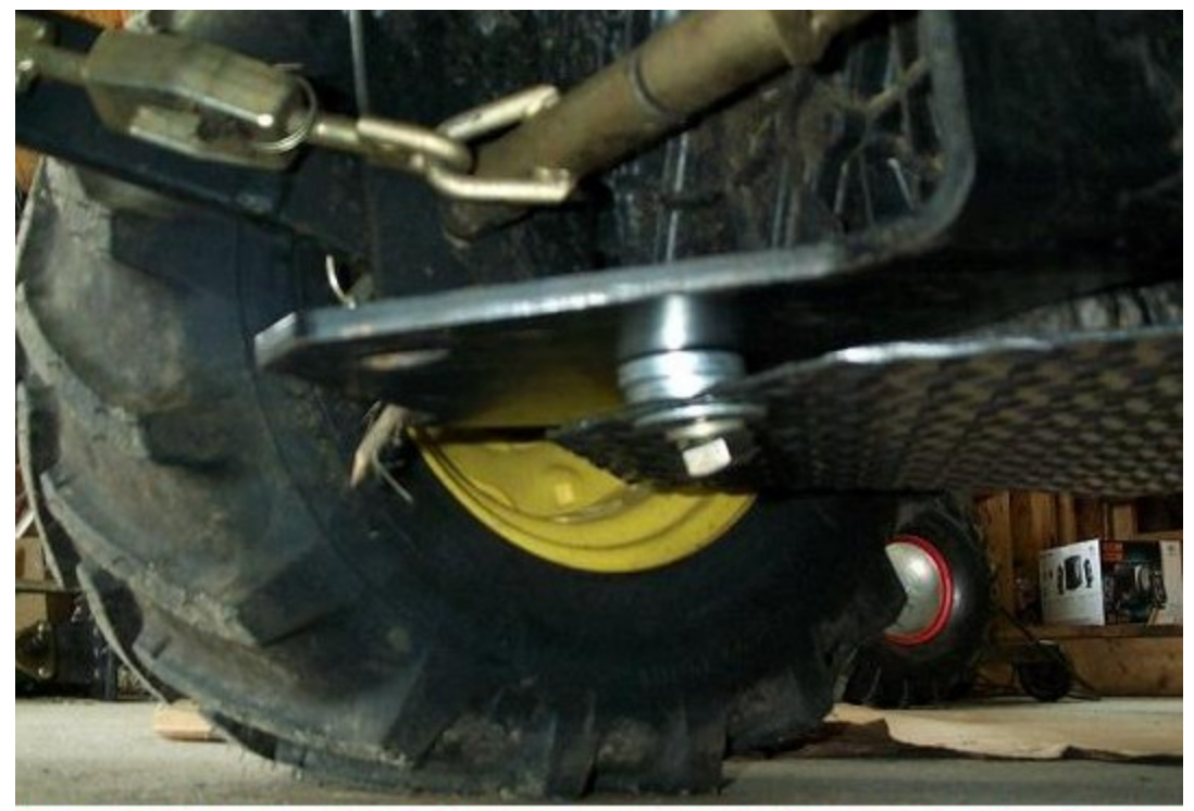
Install the two spacer & nut/bolt. Use a 15/16"

Important Safety Do not lift tractor up with jack. Use jack only to support skid plate. Stop lifting skid plate once it has made contact with rear of tractor.